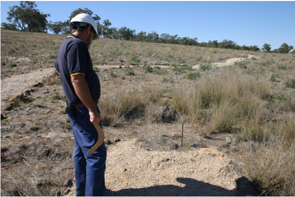
Bruce Day at one of the seven "stop sites"

The cave is lengthy and mostly submerged (depending on water table levels), and has a wonderful anticline just within its entrance. As reported in more recent editions of this Journal, the Friends of Wellington Caves , staff and innumerable cavers – over many workings bees – have been cleaning out and stabilizing the entrance, with many tonnes of soil and debris being removed.