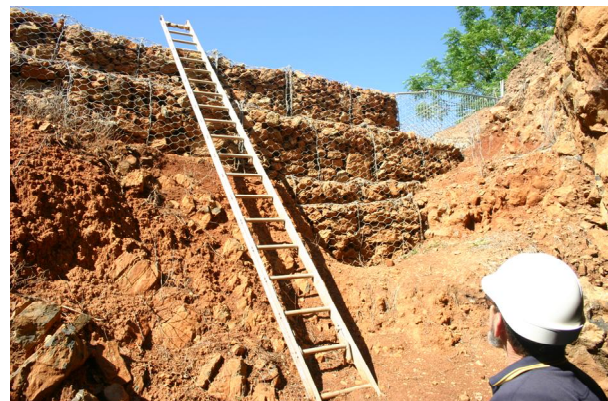
Stabilization work around the Water Cave doline A view across the "Field of Fossils", with

Two other projects of considerable note have been happening at Wellington. The first is the Water Cave. This cave, located in the middle of the caravan park next to the show caves precinct, was "re-discovered", and the entrance dug out, back in 1988 by Ernie Holland and Armstrong Osbourne et al, and reported upon in Issue 2 of this Journal.